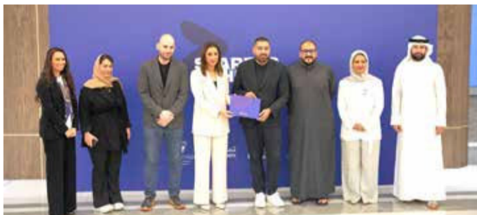
The honouring ceremony

StartUp Bahrain, the leading platform for startups in the Kingdom of Bahrain, recently concluded the ninth edition of the highly anticipated Start-Up Bahrain Pitch series with the presence of Noor bint Ali Alkhalifa, Minister of Sustainable Development and Board Member of the Labour Fund (Tamkeen). The event was organized in collaboration with key industry stakeholders, including the Ministry of Industry & Commerce, the Labour Fund (Tamkeen), the Bahrain Economic Development Board, and Bahrain Development Bank (BDB). This edition of the series featured a keynote speech by Khalid Machchate, disruptive technologies expert and Royal Policy Advisor at Morocco's