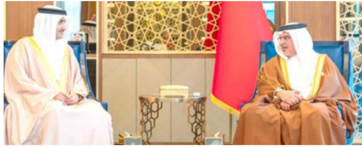
HRH Prince Salman meets with HE Shaikh Abdulla bin Khalifa

HRH the Crown Prince and Prime Minister commended the developments made in the telecommunications sector, which reflect the Kingdom's commitment to adopting innovative solutions that achieve the desired goals.