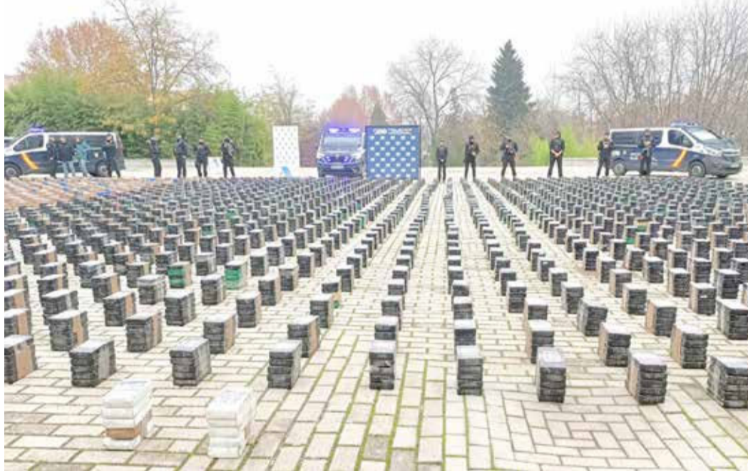
A total of 11 tonnes of cocaine in plastic-wrapped packs from two seizures made by police in Valencia and Vigo, displayed to the members of the media at the Canillejas Police Complex in Madrid

Of those arrested, most were Albanians but also a Colombian, a Dominican national and sever-