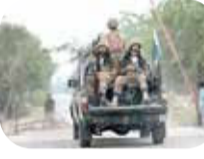
Suicide attack on Pakistan army base kills 23 soldiers: military

were killed when militants rammed an explosive-laden vehicle into a Pakistan military base yesterday, the army said, in an attack claimed by affiliates of the Pakistani Taliban. A suicide squad of six fighters attacked an outpost in Dera Ismail Khan district of Khyber Pakhtunkhwa province -- near the Afghan border -- in the early hours of Tuesday, the military's media wing said. "The attempt to enter the post was effectively thwarted which forced the terrorists to ram an explosive-laden vehicle into the post, followed by a suicide bombing attack," a statement said. "The resulting blasts led to the collapse of the building, causing multiple casualties," it added, saying all six attackers were slain as soldiers fought back. A local official who spoke on condition of anonymity said many of the soldiers "were killed while they were sleeping" in the base, a government school commandeered by the army adjacent to a police station.