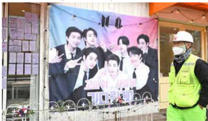
A man walks past a banner showing an image of South Korean K-pop group BTS in front of a cafe in Seoul