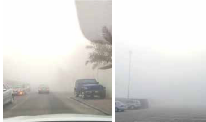
Drivers find it challenging to navigate safely through the zero visibility conditions

The fluctuating weather conditions prompted the authorities to issue a warning regarding low horizontal visibility, cautioning that visibility levels in certain areas dropped below 1,000 metres.