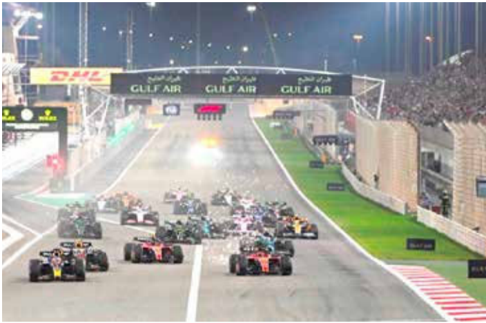
Action from previous Bahrain GP at BIC

F1 enthusiasts who believe they have what it takes to claim