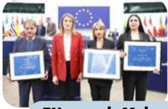
EU awards Mahsa Amini rights prize as Iran blocks family