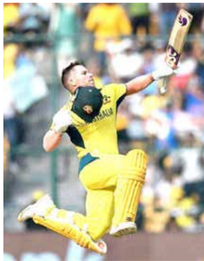
Australia's David Warner celebrates after scoring a century (file photo)

Johnson also brought up Warner's central role in the notorious "Sandpaper-gate" ball-tampering scandal