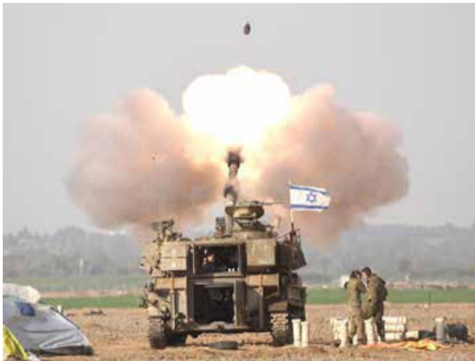
Israeli forces shell the Gaza Strip from the border area in southern Israel

Qudra said the troops were rounding up men in the hospital courtyard, including medical staff.