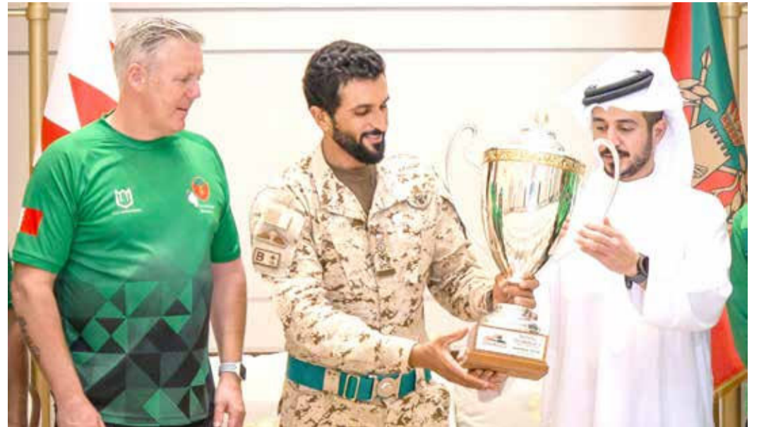
HH Shaikh Nasser bin Hamad Al Khalifa and HH Shaikh Khalid bin Hamad Al Khalifa receive the trophy

The team secured six out of nine securing six victories out of nine against the British Army's "Parachute Unit", in a testament to Bahraini boxing