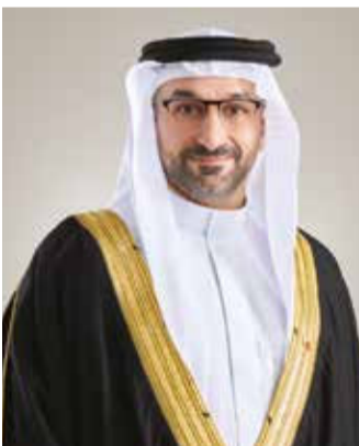
H.E. Mr. Abdulla bin Adel Fakhro, Minister of Industry and Commerce, Export Bahrain

H.E. Mr. Abdulla bin Adel Fakhro, Minister of Industry and Commerce, commended Export Bahrain on its fifth anniversary and acknowledged its significant contributions to the growth of businesses in the Kingdom