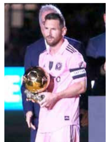
Inter Miami's Lionel Messi holds his record eighth Ballon d'Or trophy prior to a match (file photo)

Inter said on Monday the team would take on Saudi powerhouses Al Hilal at the Kingdom Arena in Riyadh on January 29.