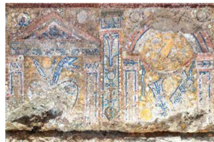
Mosaics uncovered in a luxurious Roman home near the Colosseum