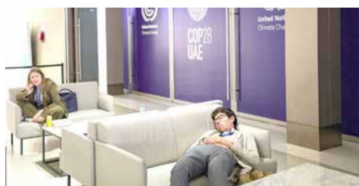
A participant rests on a couch in a hallway during the United Nations Climate Change Conference COP28 in Dubai

president Sultan Al Jaber, himself head of the UAE oil company, expired without a deal, a