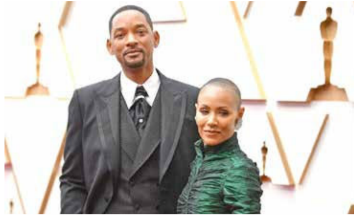
Will Smith and Jada Pinkett Smith

"The best thing is I don't need to say to Will, 'Are you OK with this couch?'. I got one that's cream patent leather but with gold studs on it. That expresses the heavy-metal side to me."