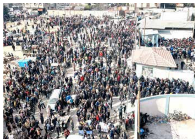
Palestinians gather to receive flour rations for their families outside a warehouse of the United Nations Relief and Works Agency for Palestine Refugees (UNRWA) in Rafah in the southern Gaza Strip