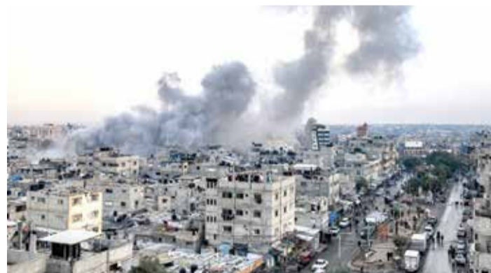
Smoke billows during Israeli bombardment in Rafah in the southern Gaza Strip

overall Palestinian economy, which includes the West Bank, had already shrunk from around 36% in 2005 to just 17% last year, according to the Palestinian Central Bureau of Statistics.