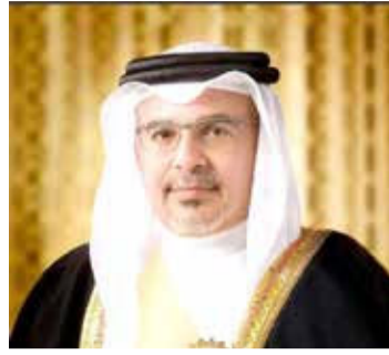
HRH Prince Salman

Article (III): The Minister of Finance and National Economy shall, based on the agreement of the Board of Directors of the Social Insurance Organisation, issue the edicts necessary for the implementation of the system