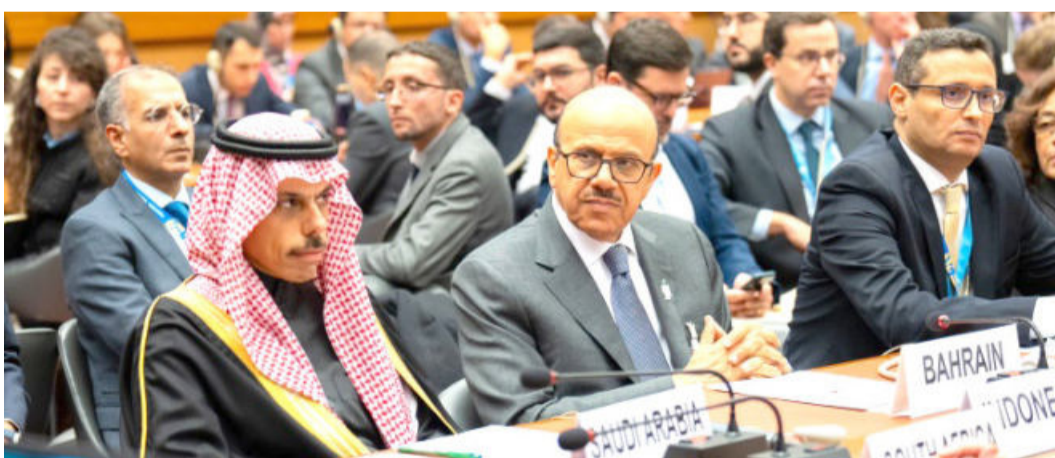
Dr. Al Zayani at the event

affirmed that Bahrain supports the rights of the Palestinian people and calls for a ceasefire and cessation of military operations in Gaza, protecting civilians, releasing hostages, he said, stressing the importance of putting an end to killing Palestinians of hunger, thirst, and the spread of diseases.