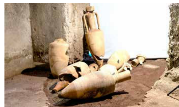
amphoras uncovered in a luxurious Roman home near the Colosseum

Among the vines and lotus leaves lie piles of weapons with Celtic-type trumpets, warships, and tridents, "alluding perhaps to a double triumph, terrestrial and naval, of the owner of the domus".