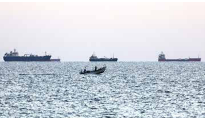
Cargo and tanker shipping vessels sail in the Mediterranean sea waters off the coast of Israel's northern city of Acre

France's defence ministry said one of its naval vessels in