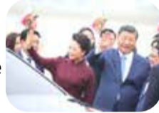
China's Xi visits Vietnam in bid to counter US

◆ China's President Xi Jinping called yesterday for a "new stage" in relations with Vietnam as he began his first visit in six years, seeking to counter the United States' growing influence with the communist nation. Xi will meet the leader of Vietnam's ruling Communist Party, Nguyen Phu Trong, later on Tuesday, after Hanoi upgraded diplomatic ties with Washington when US President Joe Biden visited in September. Speaking after his arrival at Hanoi's airport, Xi said he would talk with Vietnamese leaders on "the overall, strategic, and directional issues of China-Vietnam relations, as well as international and regional issues of common concern, in order to push bilateral relations into a new stage", according to Chinese state media.