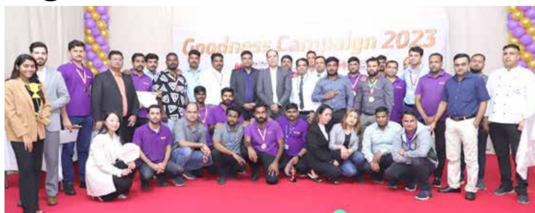
Participants during the Goodness Campaign

During this campaign, numerous tournaments, competitions, and challenges are held to engage employees and boost their morale. The competitions aim to